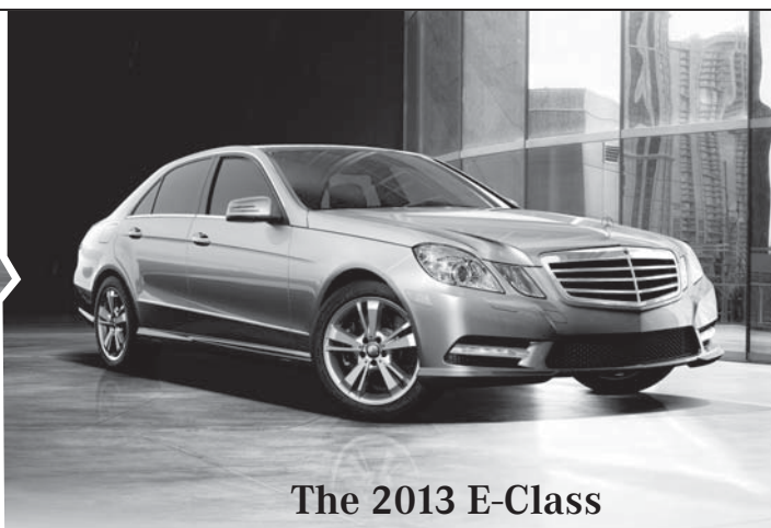
The 2013 E-Class